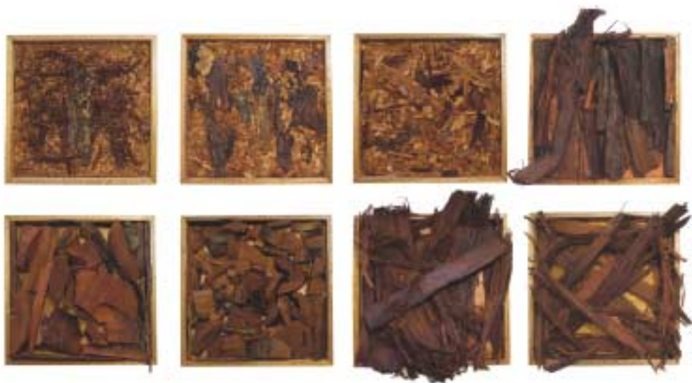
THST - With The Best Intentions, 2004, Series of acrylic boxes, 600 x 600 x 200, with recycled remains of last Hopea Sangal tree