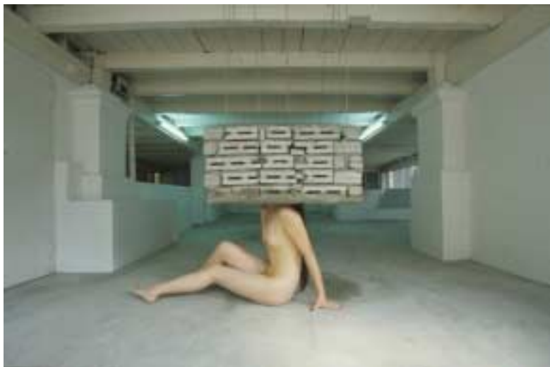
Vertical Equilibrium, Body #2, 2004, C-Type print colour photograph, 120x 150