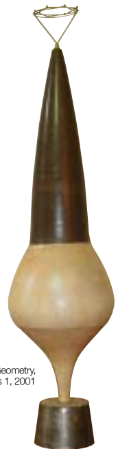
Journey of A Point To Geometry, Series 1, 2001