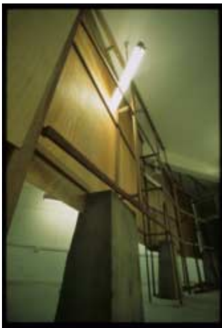
In Transition II, 2000, Dimension variable/Site specific installation, Mixed media

It is a brooding piece, a cross-section of an urban monstrosity, a moment in time flash-frozen. Rearing with titanic presence from the earth amid a mess of girders, dust and construction debris, the image of the bridge thrusts itself forward, both sides of uncompleted lanes and trussed concrete extended like pincers, bearing down on the viewer.