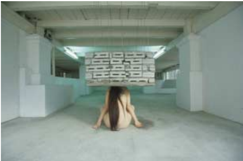
Vertical Equilibrium, Body #1, 2004, C-Type print colour photograph, 120 x 150

This investigation offers one the opportunity to create a platform to think about the necessities of constant changes to spaces and how this will in turn affect people and ultimately, alters the fabrics of society. In light of the changes that have taken place in the society, and those that will eventually take place in it, the silence of affected sites appropriates the need to comment. The aim of such a research area is therefore important to firstly raise the awareness of, and to reinstate the essence of spaces, at present and once in the past, to highlight the significance of spaces in transition and to open up boundaries and offer alternative ways of art processes in terms of making, conceptualising, presenting and receiving art. In addition, it is also necessary to explore relevant sites for the above purposes and in doing so, come to a better understanding of how to interact and intervene with the specific site based on its socio-cultural and historical contexts. Francis Ng