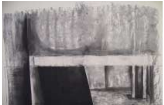
Ophelia's Morgue, Charcoal on wall, 2004, 150 x 228