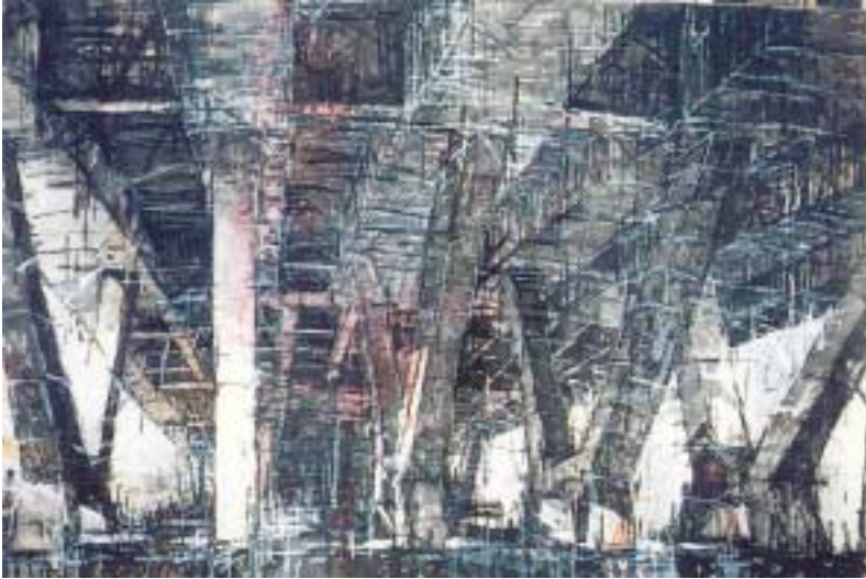
Expressway Reconstructed, 1995, Mixed Media on paper 120 x 150

is more likely to be repulsion, helplessness, or indifference. When Hong transforms existing, and familiar, architecture into images of “ruin,” as she has with the interior of Kembangan MRT station titled, Element of Asphyxia (2002), there is, however, a strange sense of relief. It is as though one is suddenly allowed to feel dejection and delight all at the same time.