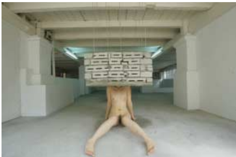
Vertical Equilibrium #3, 2004, C-Type print colour photograph, 120 x 150