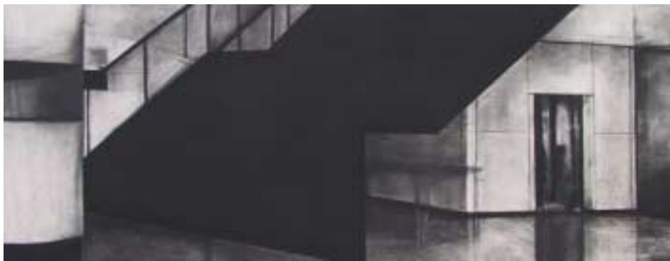
Mass Lifting, 2003, Charcoal on paper, 70 x 180

Bataille wrote: “The great monuments are raised up like dams, pitting the logic of majesty and authority against all the shady elements: it is in the form of cathedrals and palaces that Church and State speak to impose silence on the multitudes.” Sometimes described as a theorist against architecture, Bataille, like Tang, believed that architecture had the ability to condition social behaviour and also welded the authority to “command and prohibit”.