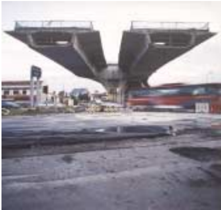
Constructing Construction #1, C-Type print colour photograph, 183 x 183