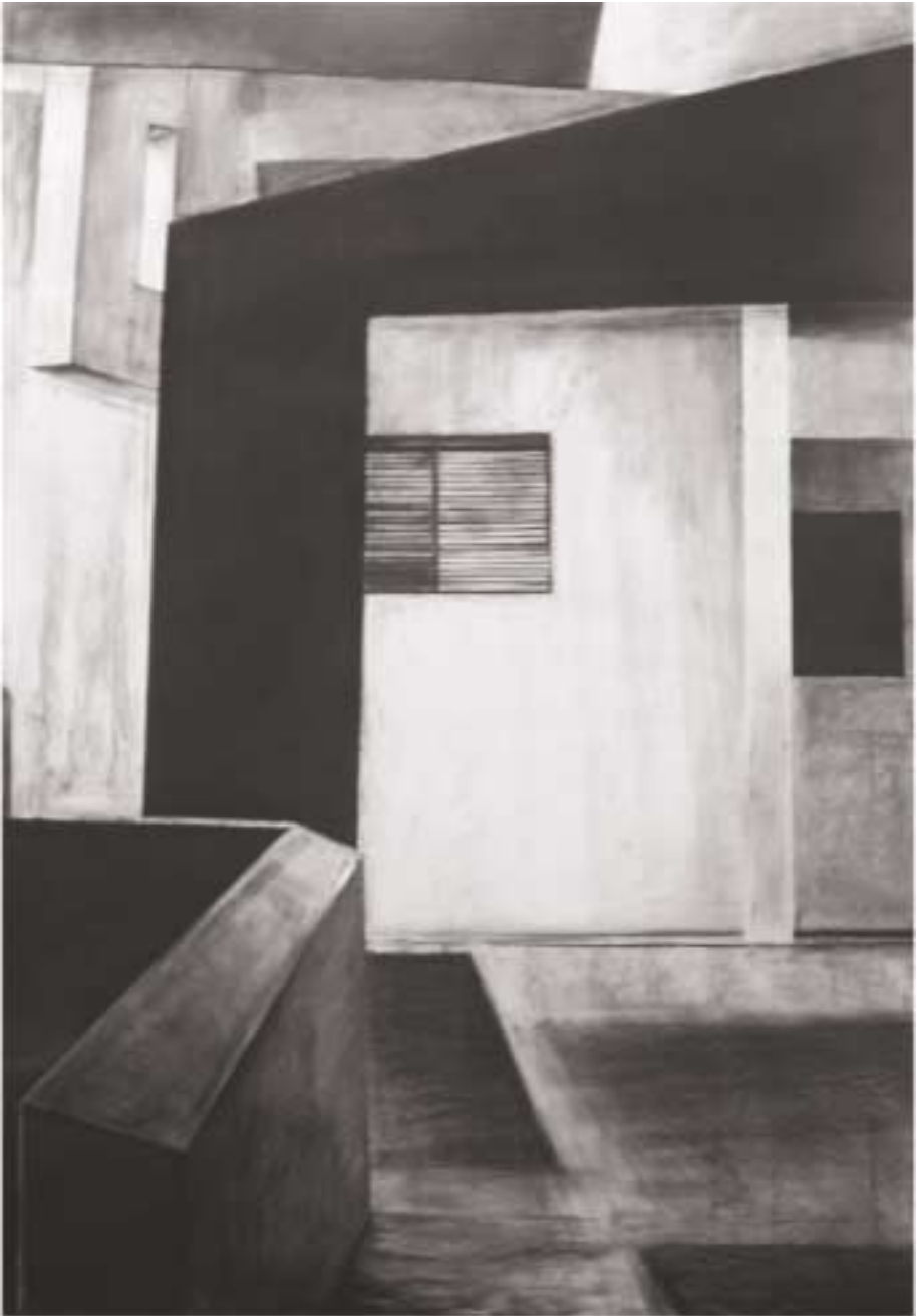
Admiralty Ziggig, 2004, Charcoal on paper, 214 x 150