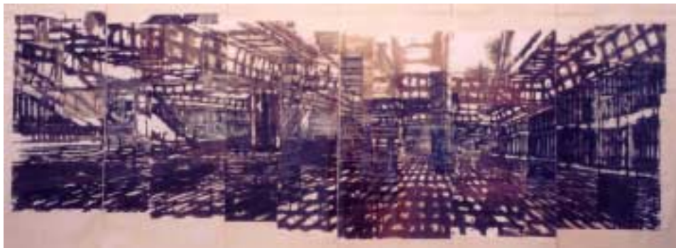
Void Deck, 2002, Ink collage on paper

allows for an element of tianyi (heaven's interest) or chance."