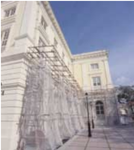
Shifting Parameters #2, 2002, Dimensions variable/Site specific installation, Mixed Media

empty space left behind by the present) collide where everything exists at once but only for a moment in time. Which, of course, raises the unanswered – no, unanswerable – question: what is the end result of conservation? Can we ever really conserve anything?