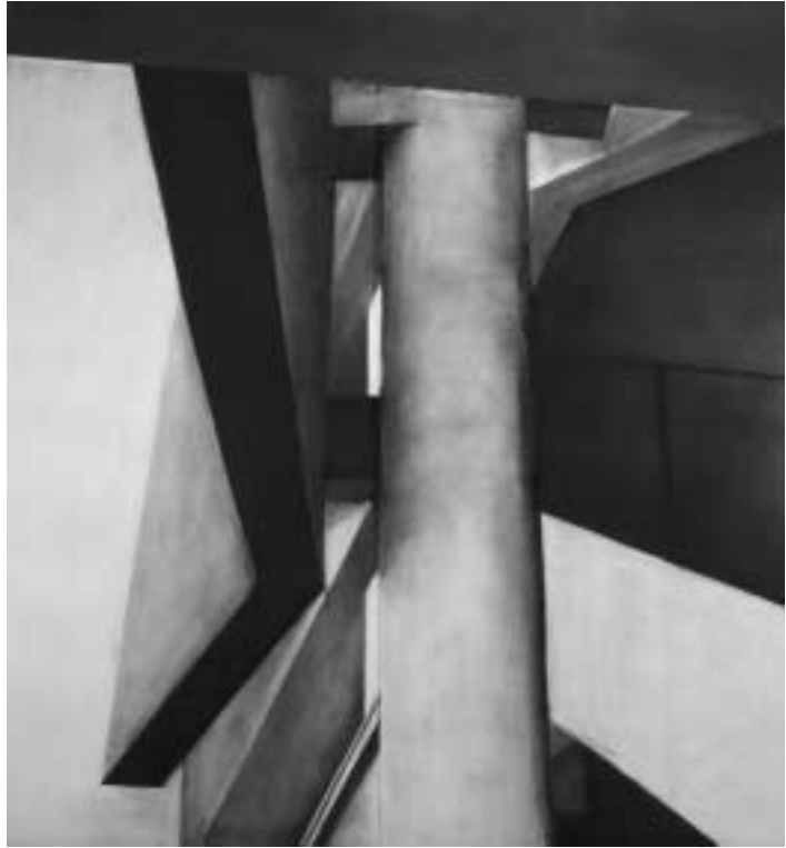
Slitting, 2004, Charcoal on paper, 128 x 120

Tang's labyrinthine escalators and air wells. Her charcoal drawings of corridors, odd structural nodes, void spaces (or in architecture speak, interstitial, transitional, left over or unresolved spaces) are redolent of a melancholy not unlike the dreamscapes of Giorgio de Chirico who incidentally denounced Modernism later in life.