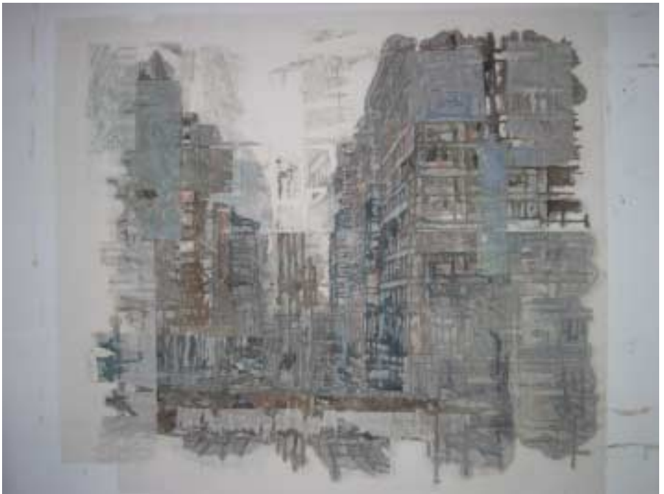
Millennia Ago, Choa Chu Kang #1, 2004, Ink on paper, 150 x 150

Various architectural motifs have been considered for this series. This serves as an extension of the earlier "Monuments". For this show, only the façade of Singapore's public housing flats were used. There was a conscious effort to create them as relics, part of a larger city in ruins like old cities of Pompeii, Rome, etc. They were thus constructed in ways that perhaps later generations were to view them: as pages from the history of humanity. Hong Sek Chern