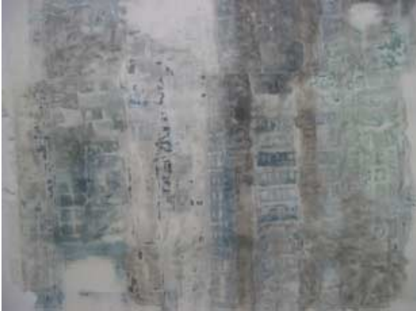
Millennia Ago, Choa Chu Kang #2, 2004, Ink on paper, 150 x 150