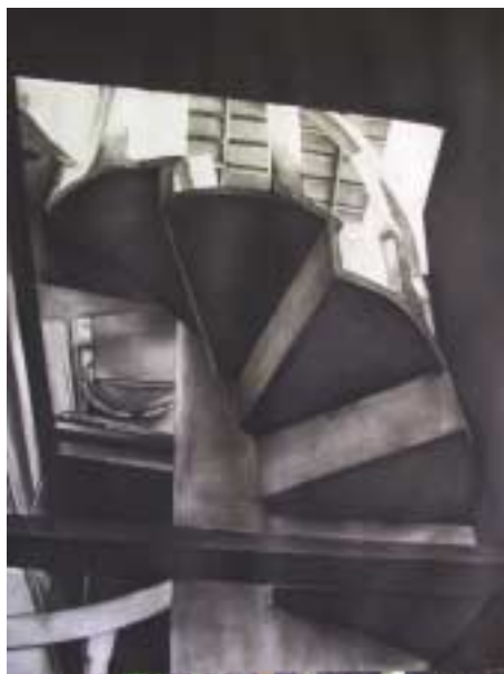
Cascading, 2004, Charcoal on paper 160 x 120

But architecture, especially modern architecture has this effect on people. Almost a century ago, the French writer and critic, Georges