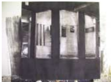
Meeting at Columnnata, 2003, Charcoal on paper, 122 x 122