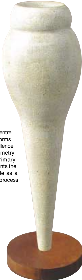
Journey Of A Point To Geometry, Series 10, 2004