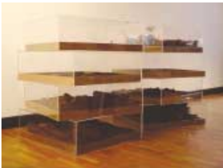
THST - With The Best Intentions, 2004, Series of acrylic boxes, 600 x 600 x 200, with recycled remains of last Hopea Sangal tree, Variable

My work investigates the relationship of space and its many related issues in the lived environment, often narrating situations that constitute our modern urban condition. Currently I am concerned with the conflicts between man, technology and nature. I see these as a metaphor for the conflict in man, between his rational and irrational self.