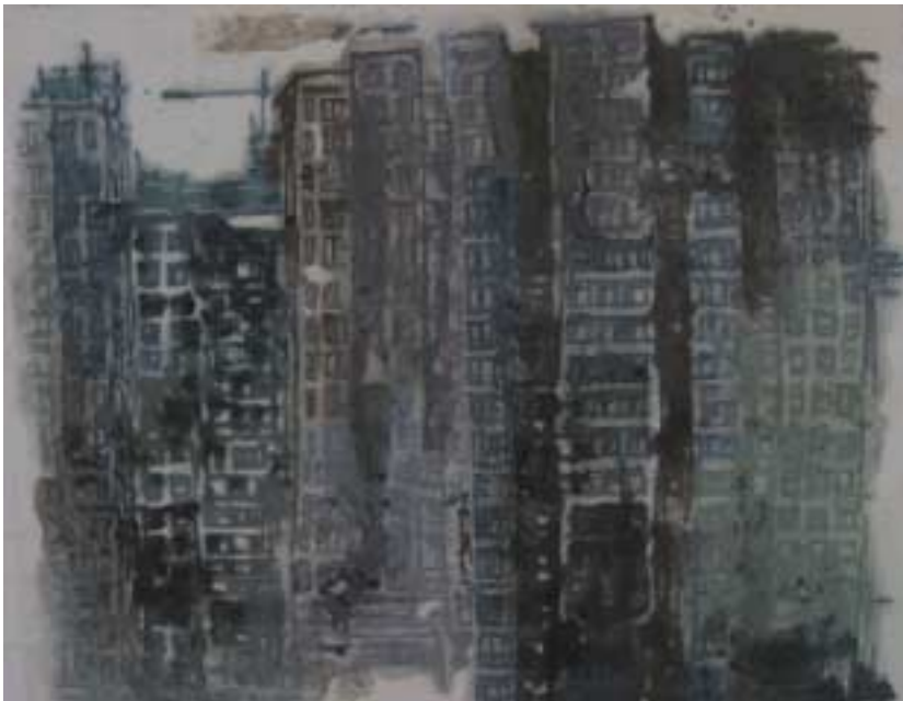
Millennia Ago, Choa Chu Kang #3, 2004, Ink on paper, 100 x 140