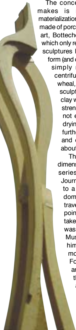
Scale model study for a minaret

This article was first published in Singapore Architect 222 and is reprinted here with the permission of the Singapore Institute of Architects